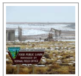
New U.S. Fracking Rules Earn Disdain from Both Sides, and a Lawsuit